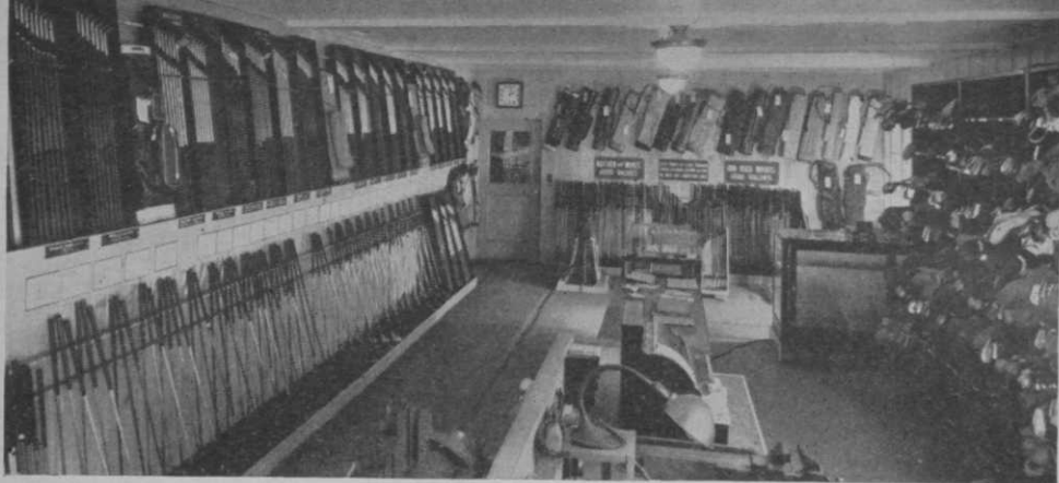
The display, identification cards, and price signs on the bags do real merchandising work. In this shop the pro had to crowd in bag storage and bench but kept it neat.

see so many golfers with clubs not suited to their builds or swing. These golfers have gone to some store where they have been sold instead of getting the proper clubs at the same price as part of the service to which they're entitled by their membership in a club.