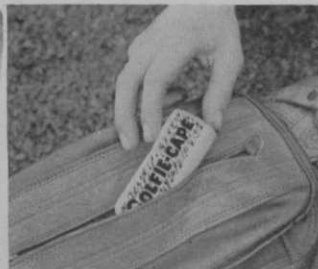
Carried in golf bag pocket

Golfers' Raincape — fingertip length. Rolls or folds into tiny 1\frac{1}{2} \times 3\frac{3}{4} in. pkg. Weighs only 3 oz. Made of tough war-tested plastic film — reinforced neck with elastic — full length sleeves — roomy shoulders and body — soft, pliable and will not stick together.