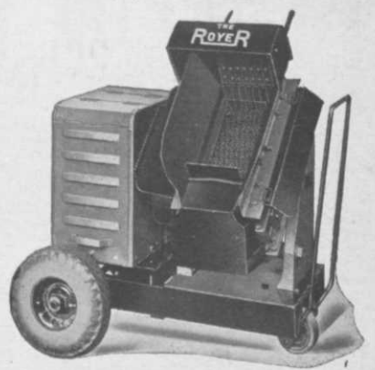
Royer Model "H"

A model for every golf course—gasoline engine, belt-to-tractor or motor driven. Prompt deliveries.