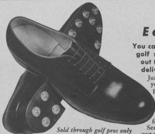
Sold through golf pros only