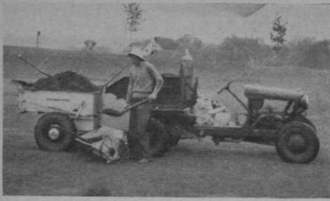
Be sure distributor feeds uniformly

to be brought to each area the first time it is used, and if records are kept of the actual amounts used, this will aid in later treatments of the same material, on that area at that rate.