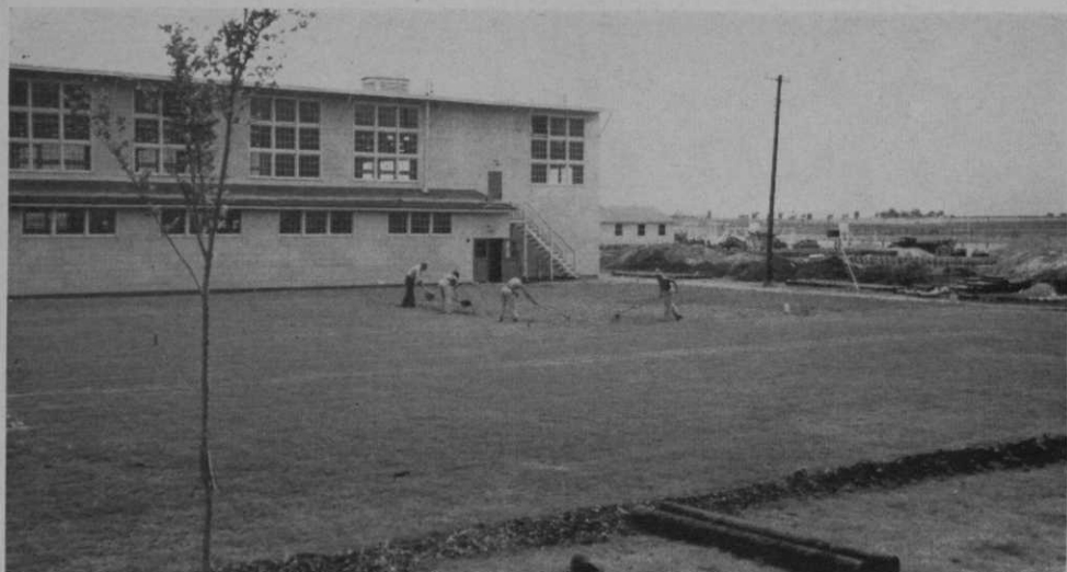
Here's another of the Army installations that have been making new golfers by the millions. It's the practice green at Ashburn General hospital, McKinney, Tex., of the PGA-financed project. A complete course is being constructed at Ashburn.