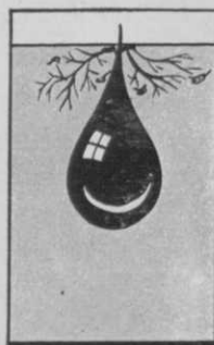
STOPS THE SEEDS

Let Dolge lessen your labor situation by chemically controlling your weed problems. One man with Dolge Weed-Killer can often accomplish as much as six with hoes. Unwanted growth in sand traps, tennis courts, parking areas, drives, walks, gutters—thistle, nettles and briars in the rough are chemically destroyed. Limited quantities expected, so place your order today. Write today for Booklet Au2 .