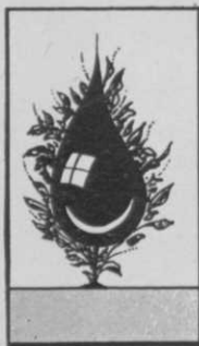
KILLS THE TOPS