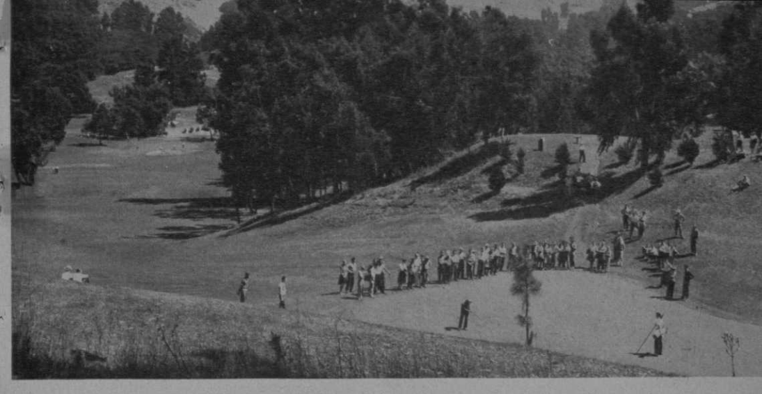
Ninth green at Tilden Park. Background shows portions of first nine. Tenth tee at right.