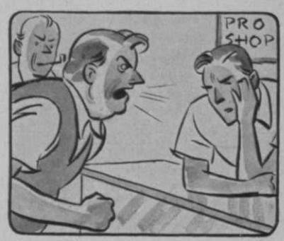
W-H-A-T!!!! Didn't you send any used balls to Wilson? That's terrible!!