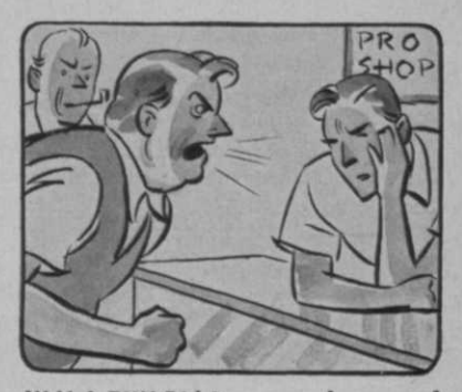
W-H-A-T!!!! Didn't you send any used balls to Wilson? That's terrible !!