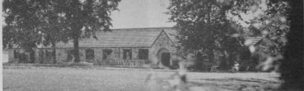
Front view of Walnut Grove's attractive clubhouse, which overlooks the first tee and eighteenth green. Additions were made to the structure in 1936, '38, '40 and '42.