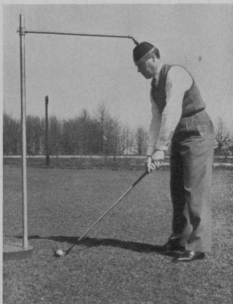
'In the harness' and all set for a perfect drive.

The device consists of a 7-ft. pipe arising from a heavy iron base. Horizontally