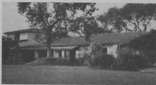
The Ojai Valley CC near Santa Barbara, in the land of the old missions and the haciendas of the early dons;

Three examples of clubhouses that fit into the local tradition and scenery: