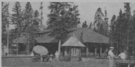
The clubhouse at Jasper National Park among the steeped woodlands of the Canadian Rockies, and