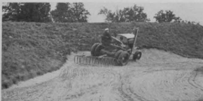
Tractor-pulled rake does a quick, economical job of trap maintenance at Anderson's course.