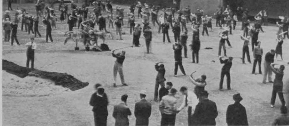
A portion of the group of 350 students, faculty members and townspeople who took part in the Purdue class instruction session.

the participation of pros who have been signally successful in their jobs. It was evident that the wise pro, regardless of age, considered that his individual success didn't blind him to the fact there was plenty still to be learned about the business of golf. It also was repeatedly in evidence that the smart pro didn't place his trust in the panaceas frequently cited as the pros' main hope of making a good living, but had found that the pros' salvation lies with the educated and energetic individual.