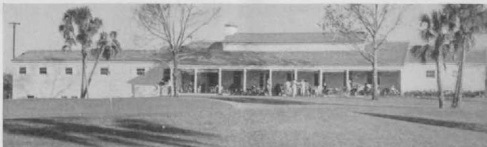
Veranda of Miami Shores clubhouse overlooks the 18th green—which doesn't make the final hole any easier. The building is a part of the $300,000 plant opened this past season.

which runs through the course, and which on this hole gobbles up a hook ball with the greatest of ease.