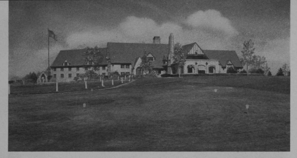
This practice putting green at Wellshire Municipal Golf Course in Denver is practically always in use. Clubhouse is in background.