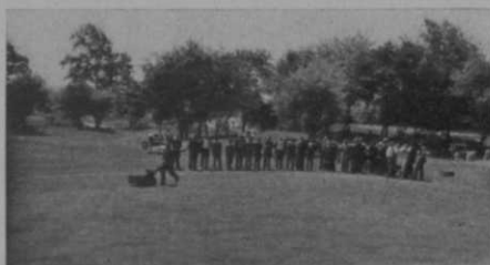
Stumpp and Walter field demonstration given May 25 at Forest Hill Field Club, Bloomfield, N. J.

supply distributors, and seedsmen, have finished a great series of field demonstrations in N. Y. Metropolitan district. The demonstrations and lectures were practi-