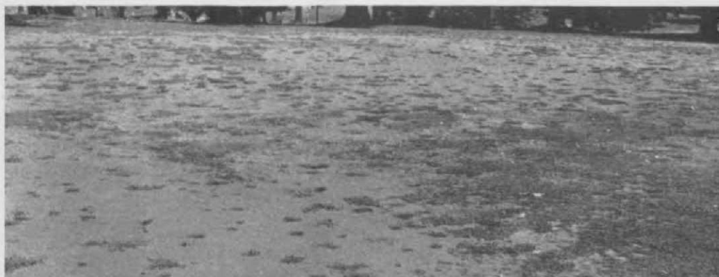
Remains of what once was a fine putting surface. Damage occurred under climatic conditions not found in Northern summer resort areas.

the grass on the course has to stay at home and take the weather as it comes.