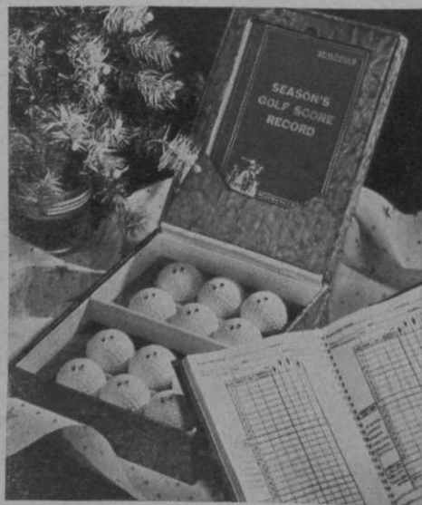
The large dozen-size Spalding gift box with scorebook and USGA rules.

The smaller box, containing six top-quality balls, has been carried out in like