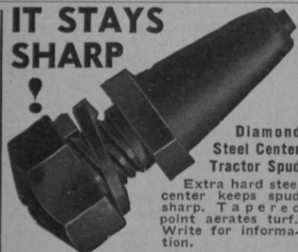
Diamond Steel Center Tractor Spud

Extra hard steel center keeps spud sharp. Tapered point aerates turf. Write for information.