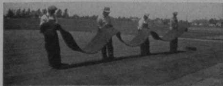
Showing a solid length of Bent turf to illustrate its toughness and strength, made possible only by proper preparation of soil.