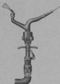
"Stream-Flo" Quick Coupling Valve and Sprinkler. Covers evenly areas 100 to 225 feet in diameter.