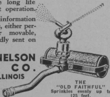
THE "OLD FAITHFUL" Sprinkles evenly up to 125 feet.