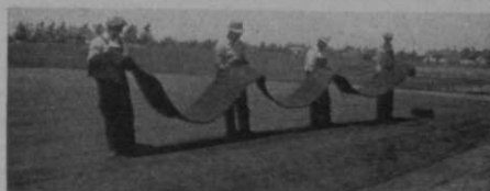
Showing a solid length of Bent turf to illustrate its toughness and strength, made possible only by proper preparation of soil.