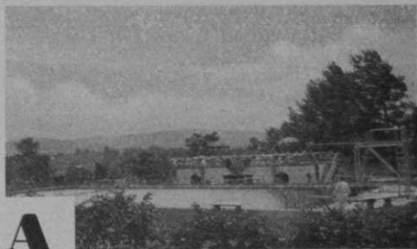
"GUNITE" Pool at Lehigh Country Club, Allentown, Pennsylvania

An interesting detail of the Hillcrest pool operation is a small charge if more than one towel is used. Heavy use of towels at club pools, at some clubs averaging three per swim, has been a shock to managers. Pool popularity has been great for food and drink sales and for family patronage. At many clubs this year, guest fees were found to be too low.