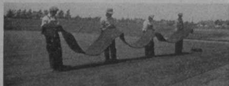
Showing a solid length of Bent turf to illustrate its toughness and strength, made possible only by proper preparation of soil.