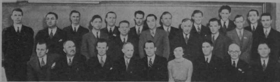
Students and instructors of the 1935 Rutgers short course.