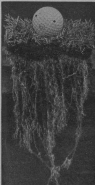
Root Growth Triple A Bent

LATE SUMMER OR EARLY FALL SOWING IS BEST