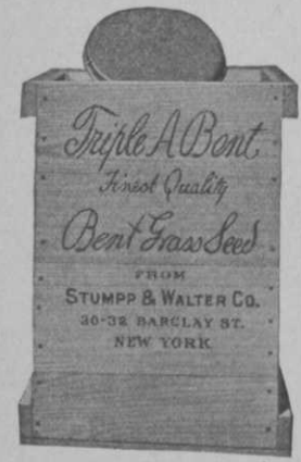
Seaside Bent and Triple A Bent packed in 50 lb. tin canisters, enclosed in strong wooden boxes for protection, preservation, identification.

Samples recleaned to conform to our high standards pay for themselves in lower weeding costs.