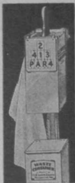
Showing Portion of Tee Ensemble

G. B. LEWIS COMPANY Dept. GD 734 Watertown, Wis.