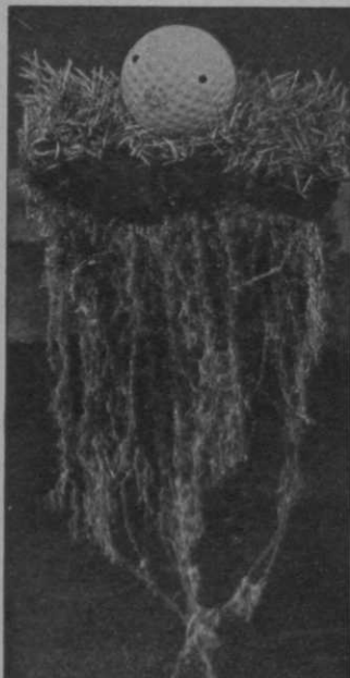
Root Growth Triple A Bent

All varieties of Bents and other grasses and mixtures for fine turf. Golf Course Requisites, Fertilizers, Brown Patch Remedies, Irrigation Equipment, Sprinklers, etc.