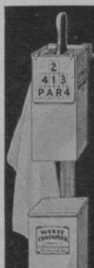
Showing Portion of Tee Ensemble