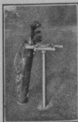
Bag Rack $4.75

Detroit, Mich.—A rubber grip called "The Ideal," made by the Sport Specialties Co., 130 Cadillac Sq., is getting into big sales at pro shops. The grip is slipped over the end of the shaft, which has been moistened with a little soapy water. A bicycle pump hose, which is equipped with a special valve supplied with the grips, is put into a hole at the end of the