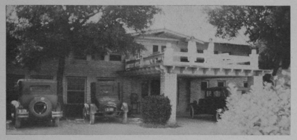
Pleasant landscaping makes Temple clubhouse attractive