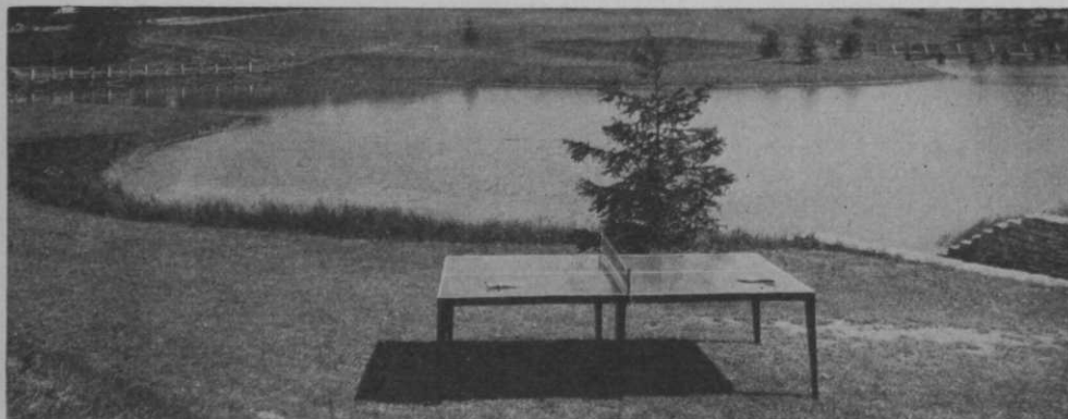
Table-tennis, hitherto confined to play inside the clubhouse because of the difficulty of getting a table that will bounce a ball true, now is one of the outdoor sports. A steel table, weather-proof and with a bite that lets the little ball do all its tricks, has been invented. Here it is shown installed at one of the Chicago district golf clubs. They can leave it out all night and day without injury, or if some of the folks want to play inside, it folds quickly and transports easily. Price is low and that means something these days.

Mfg. by Perfection Sprinkler Co., Plymouth, Mich.