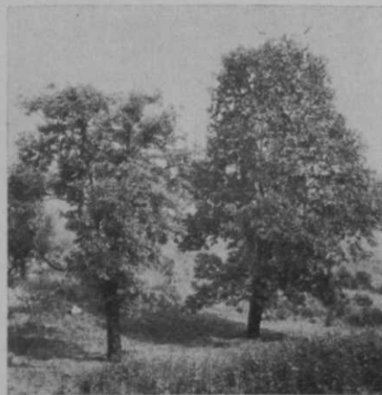
Same trees, August, 1930, showing effect of three years of fertilizer applications