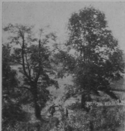
Two white ash trees, August, 1927, being given first of annual fertilizer treatments

Cultivation has long been considered a means of introducing air to the soil. Research of recent years indicates quite strongly that stirring of the soil, aside from reducing weed competition for moisture and nutrients, has been over-emphasized. It seems doubtful if surface cultivation would very greatly influence root conditions in the undisturbed soil layers 18 inches or more in depth. Furthermore, when our landscape picture is made on a carpet of green we do not take kindly to having patches of it laid bare in order that our trees may enjoy the benefits of cultivation.