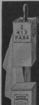
Showing Portion of Tee Ensemble

Tee Ensemble—lots of 1 to 10 $10.25 " " —lots of 11 or more. $9.75