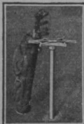
Bag Rack, $5.50

CONCEALED traps and bunkers have no place on the golf course because when they are out of sight they do not register on the player's mind as he is about to play the shot and therefore offer no mental hazard.