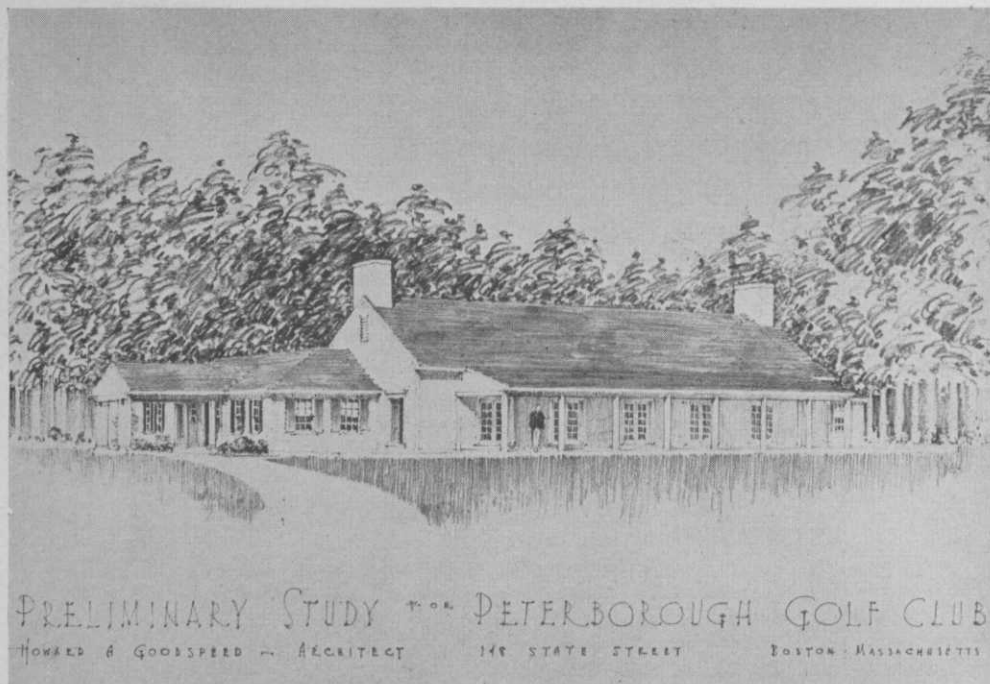
Architect's preliminary sketch shows how the Peterborough clubhouse will look when finished.

doors on the south lead to the wide covered porch which extends practically the entire length of the south side of the main building. The walls of the assembly room are sheathed with country pine and the ceiling extends up into the roof and exposed trusses.