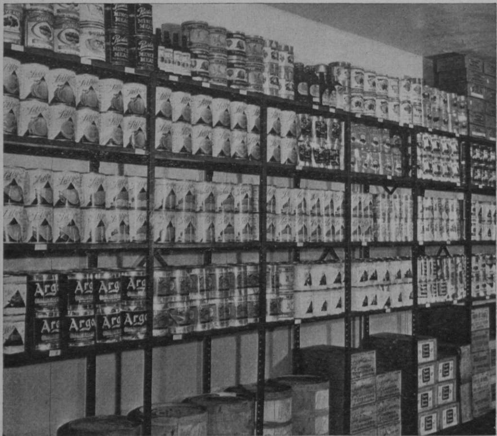
Steel shelving permits neat arrangement and efficient withdrawals in the commissary.