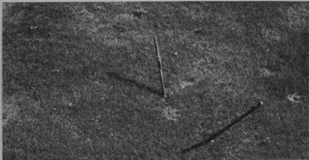
The pencils mark the edges of a strip of restricted turf growth, due largely to uneven distribution of fertilizer prior to seeding.

The young grass plants grew normally and appeared much benefited by several light showers, the heaviest of which was .14 inch. On May 8, the rainfall was .97 inch and on May 10, 1.65 of an inch fell. These two rather heavy showers wet the