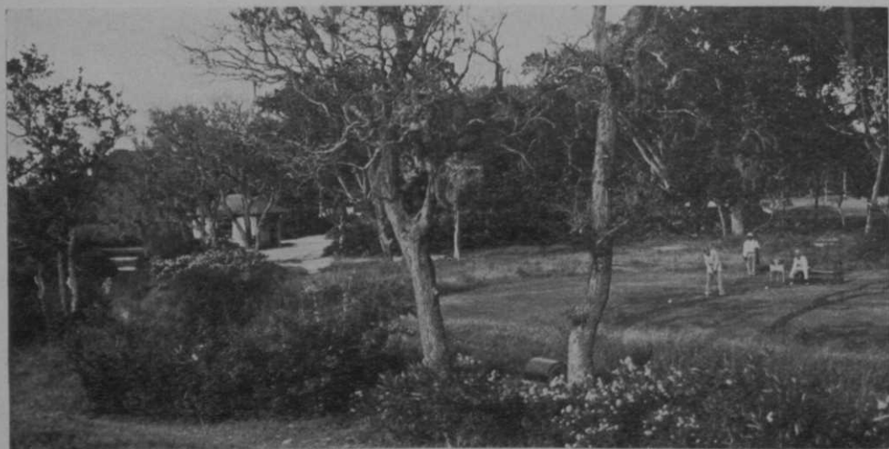
On the right, Sea Island's ninth tee; on the left, the pump house which supplies the course watering system.

many years. I was very fortunate in being able to water my tees and fairways as well as the greens. I have nine sea-