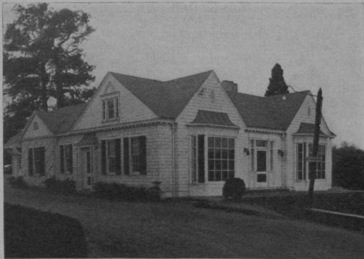
This looks like a clubhouse, but it's Ogilvie's new shop. Note the large bay windows affording a view of the course beyond.

Back of the Lounge is a private room and bath for visitors to the club and in the basement are locker rooms and showers for the pros.