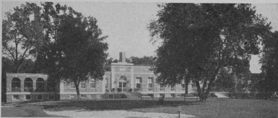
From the clubhouse at Park Ridge, members look through the trees far out over the course.