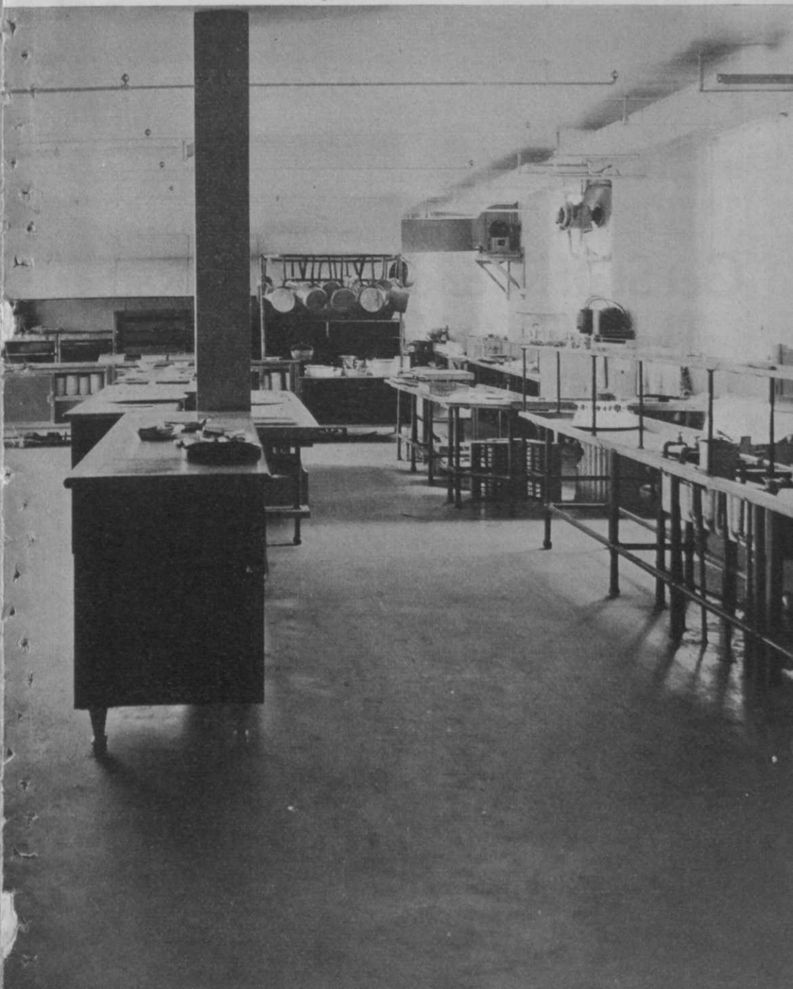
Photo: Corner of kitchen, electric-equipped, Medina C. C., Chicago district.