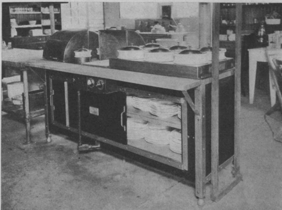
This steam table at Riverside is electrically operated and gives adequate service.

kettles assure perfect products with a minimum of effort, and the better working conditions enhance kitchen efficiency. Service efficiency is improved by the better arrangement of the equipment possible with electric equipment.