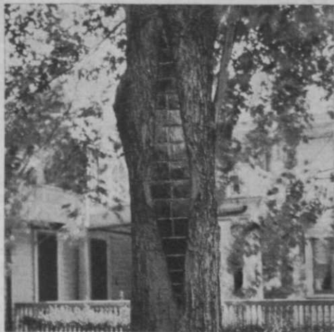
Another valuable tree saved. Eventually, the filling will be entirely concealed by bark which will grow over it from either side.

To be satisfactory, the substance used for filling the cavity must have great mechanical strength to resist the tremendous strains which result when the tree sways back and forth; it must be durable; it must provide a proper surface for callus growth to creep over it; and it must be comparatively inexpensive and easy to install. Concrete, installed in sections separated by a special joint material, has been found to be ideal for the purpose. The sections function in much the same way as the vertebrae of a person's