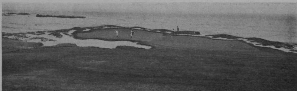
The famous seventeenth at Pebble Beach. One of many uses of natural features that have made this course a world wonder.

south. San Francisco has not been blessed, or cursed, with the number of tourists who have come to visit and stayed to reside and play golf as has its sunnier companion. It is more strictly business-like and less the playground. The cool heavy fogs of this seaport are less desirable to the visitors from Iowa than the climate of the southern counties.