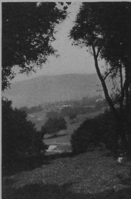
No. 2 at Flintridge C. C. (Pasadena, Calif.); a view from the new tee. The green is at the end of the fairway curving to the right

in the dollar variety but is kept under control without too great expense or trouble. Bermuda grass as a problem is practically unknown here as are many other weeds. This may be because the greenkeepers have them under better control or because soil and cool climatic conditions are not suited to them. Daisy plants in the fairways may present a diffi-