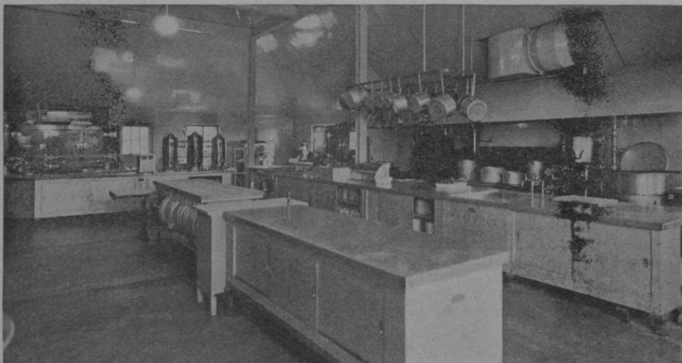
This kitchen at Maketewah C. C., Cincinnati, gives a good idea of how the modern golf clubhouse represents a big investment for the purpose of serving the best, in the best way

The five to five and a half pound bird has proven very profitable, especially so since you can secure four nice a la carte portions from this size duck. Again may it be emphasized that the best quality purchased according to needs will result in the most satisfied clientele, as well as a good food percentage and food profit statement.