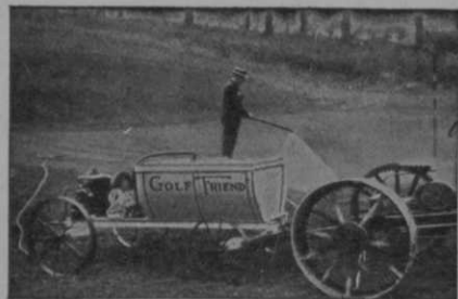
One of the smaller machines at work

Last August the membership voted an assessment of $250.00 and about four hundred members have met this assessment to date. If you pay this assessment you are insured under a 20-Year Endowment Policy for $250.00 plus the amount you have already paid in for your membership. The Club pays the premiums on the Life Insurance Policy, which means that you or your beneficiary are assured of the money paid in and you have your membership equity without cost. The money so collected will remain in trust until there is sufficient amount to go ahead with the building. If sufficient money is not raised, the money less nominal expenses will be returned.