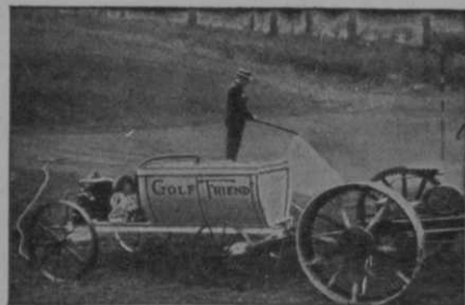
One of the smaller machines at work

Last August the membership voted an assessment of $250.00 and about four hundred members have met this assessment to date. If you pay this assessment you are insured under a 20-Year Endowment Policy for $250.00 plus the amount you have already paid in for your membership. The Club pays the premiums on the Life Insurance Policy, which means that you or your beneficiary are assured of the money paid in and you have your membership equity without cost. The money so collected will remain in trust until there is sufficient amount to go ahead with the building. If sufficient money is not raised, the money less nominal expenses will be returned.