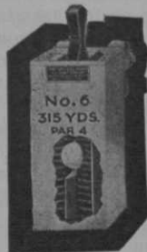
Showing how the ball is washed in a Lewis Golf Ball Washer.