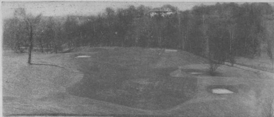
Here is something the greenkeepers may see during their convention at Louisville. It's a winter view from the tenth tee of the Louisville C. C.

to each green. The Paris green effectively eradicated grub worms, commonly known as the Army worm, and various other forms of insect life. Bermuda stolons were then planted and rye grass seed was worked into the soil with a gang of spiked rollers. The cottonseed meal and lime stopped the sand from blowing away and gave a firmness to the soil, if you could call it soil, because it is practically all clear white sand.