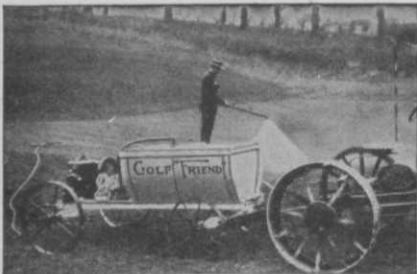
One of the smaller machines at work

Size, layout, equipment and a general outline of operating methods comprise the range of the book's material, and a number of photographs and plans of club installations serve to make the details plain to club executives. One interesting indication of the wide variations in handling the kitchen problem of country clubs is noted in the analysis of restaurant and kitchen space in typical country clubs. The per-