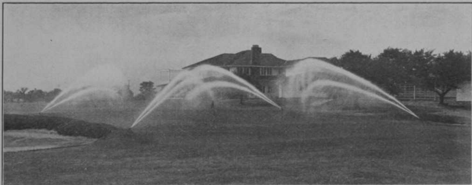
Four automatic green sprinklers in operation at Cascade Hills Country Club, Grand Rapids, Mich.

hoseless tee system, with a single hose outlet at each green, was contracted for at $2,638.00 but the committee decided they wanted hoseless green sprinklers, which required an extra expenditure of $2,984.00 including 60 fixed position above-ground sprinklers. The hose, portable sprinklers, couplers, etc., cost about $800.00.