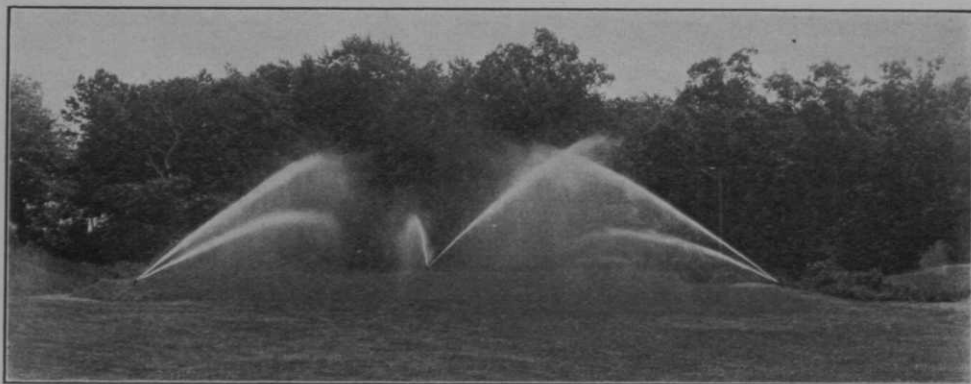
A well-watered green at Cascade Hills Country Club. Three automatic sprinklers do the job.

wells in that vicinity. The Pomonok system is complete, including automatic concealed tee sprinklers under individual control, with fairway hose system and snap valve outlets for the greens. This system required 15,170 feet of 2, 4, 6 and 8 inch cast iron pipe, 118 snap valve outlets, and 26 concealed tee sprinklers, all at a cost of $23,692.00. The hose, sprinklers, and couplers cost $1,020.00, the pump-house structure $2,750.00, while the booster pumping plant with automatic control cost $4,102.00, or a grand total for the entire construction of $31,564.00 including all