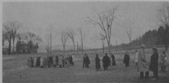
Some of the 100 who looked over the M. A. C. turf gardens during the school's greenkeeping conference.