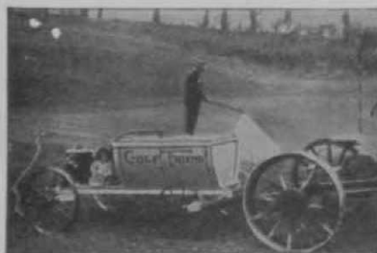
One of the smaller machines at work

Annuals , which complete growth in one year and produce seed abundantly.